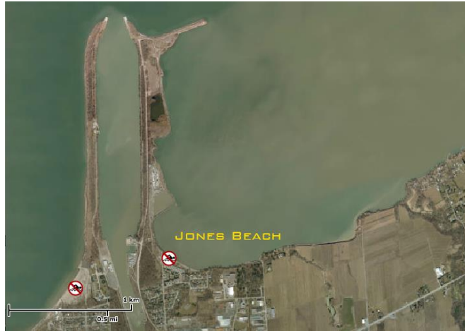
Jones Beach, Lake Ontario