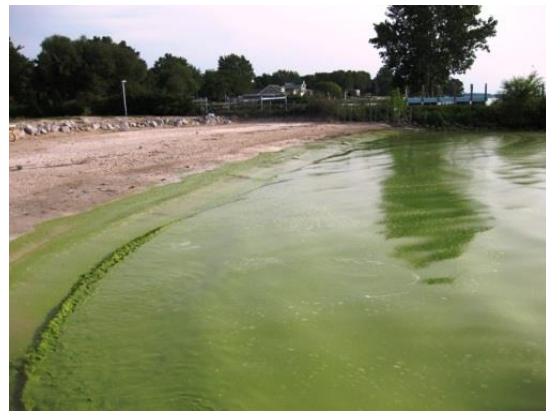
Blue-Green Algal Bloom, Catawaba Island, Lake Erie (NOAA 2009)

When there is an abundance of algal blooms in recreational water, beach closures are necessary. Most algal blooms are relatively harmless, but blue-green algal blooms produce a wide variety of toxins that include neurotoxins, liver toxins, cell toxins and skin irritants. The neural toxins, in large concentrations, can result in muscle cramps, twitching, paralysis, and cardiac or respiratory failure. The toxins can also cause nausea, vomiting, acute liver failure, skin irritations and rashes.