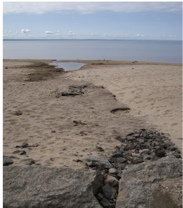
Water outfall, Lake Erie, 2012

Niagara’s sandy beaches are a unique feature that is often overlooked. Historically, people travelled from across Canada and the United States to come to Niagara’s beach areas and enjoy themselves with the diversity of recreational opportunities offered. People still regularly use Niagara’s beaches and some still travel from New York State to enjoy themselves on our beaches. Industrial, residential and agricultural pollutants and rising water temperatures have affected beach quality in the past and there have been continuing efforts to increase water quality in the Great Lakes. The risks are monitored by a team of public health staff who ensure the most accurate beach quality reporting possible in an effort to keep swimmers and beach-goers safe.