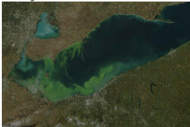
A large Blue-Green Algal Bloom, Lake Erie

When high nutrient or light levels are present, there is an increased risk for algal blooms forming in the Great Lakes. Algal blooms are various types of algae (most commonly blue-green algae) and some contain toxins that produce harmful conditions to marine life and humans (Niagara Region, 2012). Different types of algal blooms exhibit various risks and are becoming more common due to global warming. While northern waters used to be too