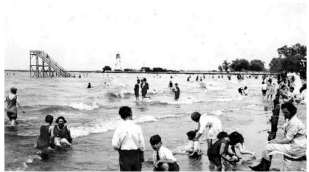
Lakeside Park

Despite the closure of most of the amusement parks and attractions, the sandy beaches still remain. Reduced pollution in the lakes means that the beaches around Niagara can be enjoyed again for recreation and swimming.