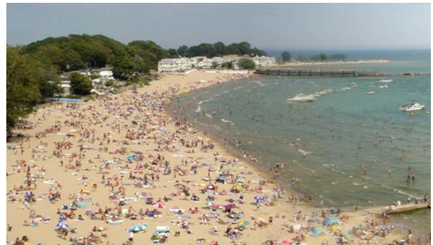
Crystal Beach (Niagara Region)