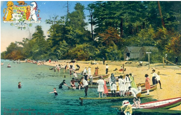
Grimbsy Beach

After the turn of the 20 th century, beaches in Niagara were in a cultural renaissance. Amusement parks, swimming, dance halls and boating drew tourists from Canada and the United States. Ships accommodating up to 3,500 passengers including the Americana and the Canadiana shuttled tourists to Crystal Beach, to the hotel, bathhouse and Crystal Beach Amusement Park. Ship passengers could enjoy themselves on board with dance floors and entertainment and once at Crystal Beach, they could experience the rollercoasters and dozens of rides at the park.