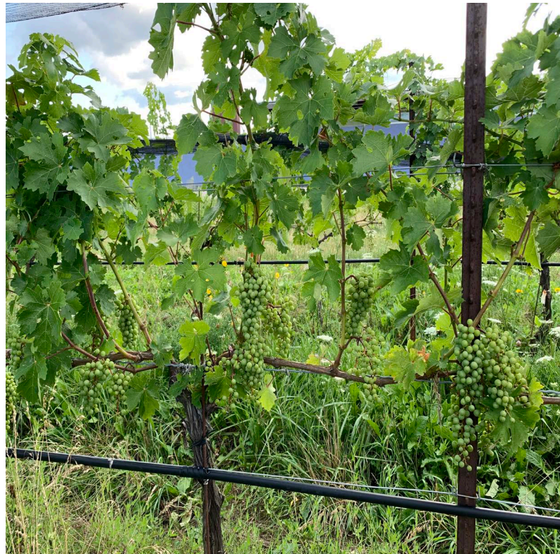
Organic vineyard research site in Niagara, Ontario.

Our project with organic vineyards is demonstrating the challenges for farmers in dealing with this unpredictability. In 2019, the spring and summer were cool and rainy but 2020, alternatively, was hot and dry, especially in the summer. While early 2021 was semi dry, the last months of the growing season were cool and wet. This led to high variation in yield and berry quality from year to year. To buffer these variations (which can also be daily as well as seasonal), cover cropping is promising, and our research suggests that biodiversity can support this advantage. Indeed, soil temperature can be cooler by several degrees when cover crops are added, even under the rows of vines. While more research is still needed to better understand which species are best in the local context, it is now important to think about how to transfer the information to other regions of the world where farmers are facing similar challenges, such as South America and Africa.