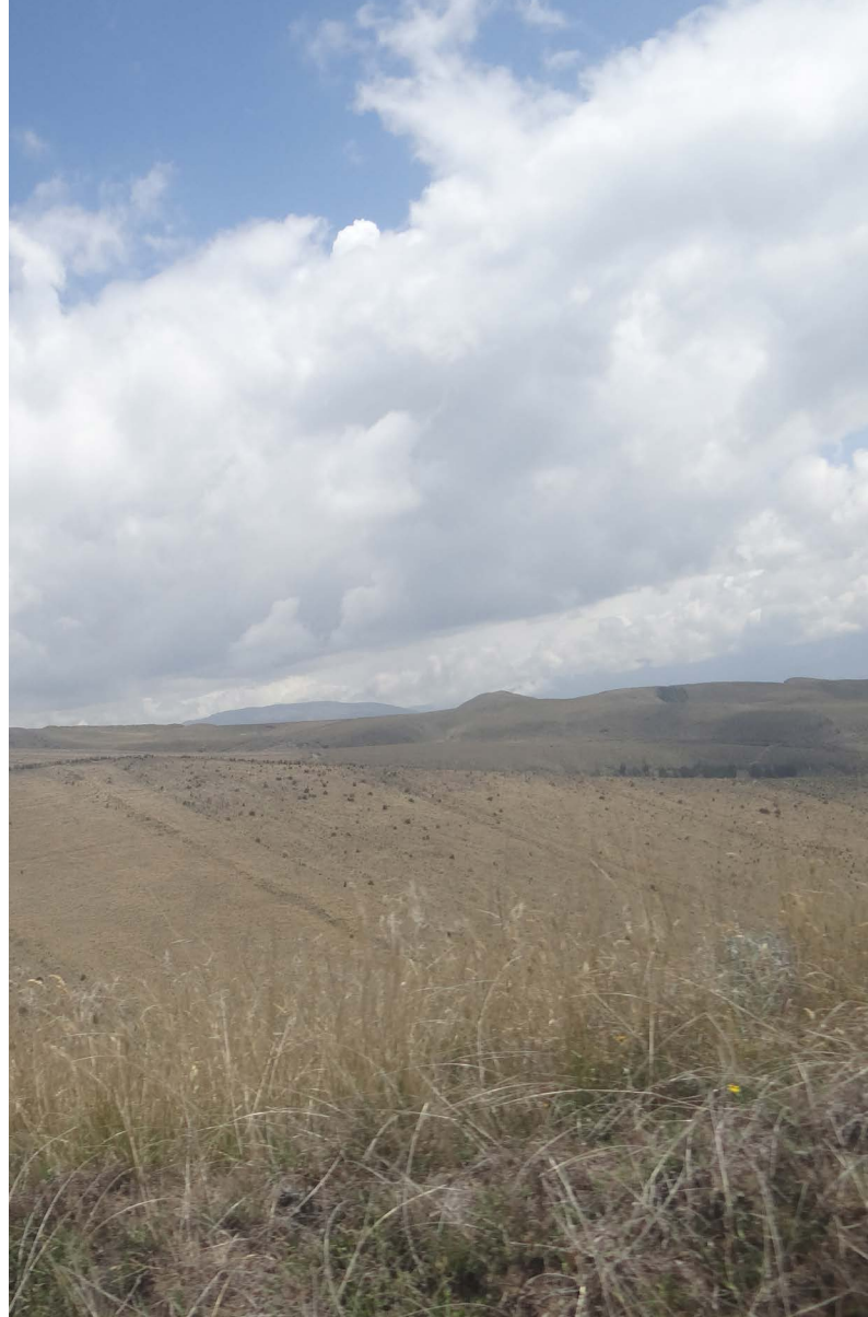
Ecuadorian Andes, in the province of Chimborazo.

We all hope to have a new one in the coming year.