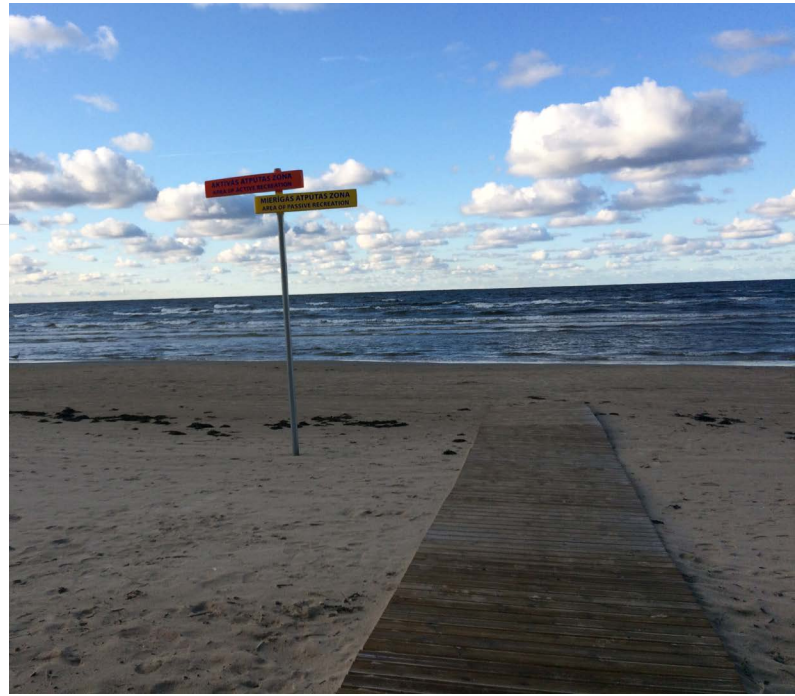
Beach in Jurmala, Latvia, September 2019