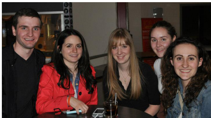
Organizers of the benefit concert for the 5 Days Campaign