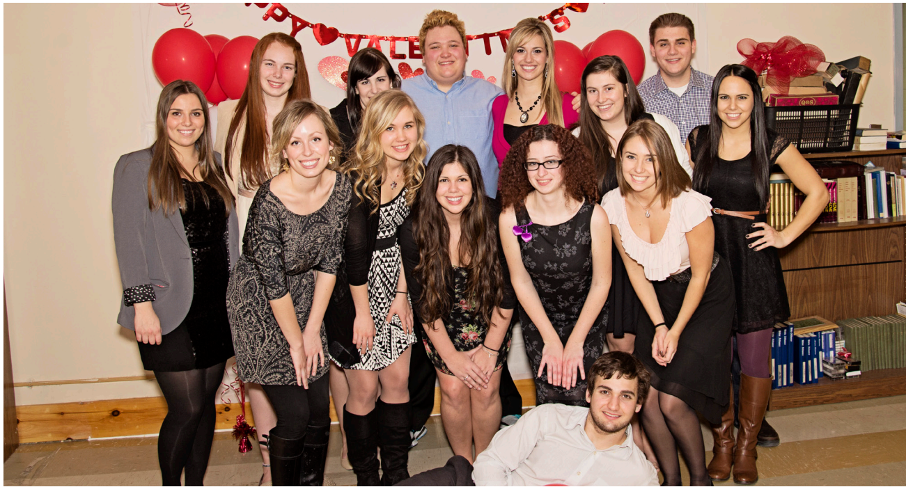
BLCS members were all smiles during the Senior Citizens Valentine's Day Prom