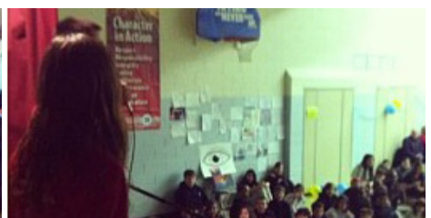
BLCS members at the DSBN Academy