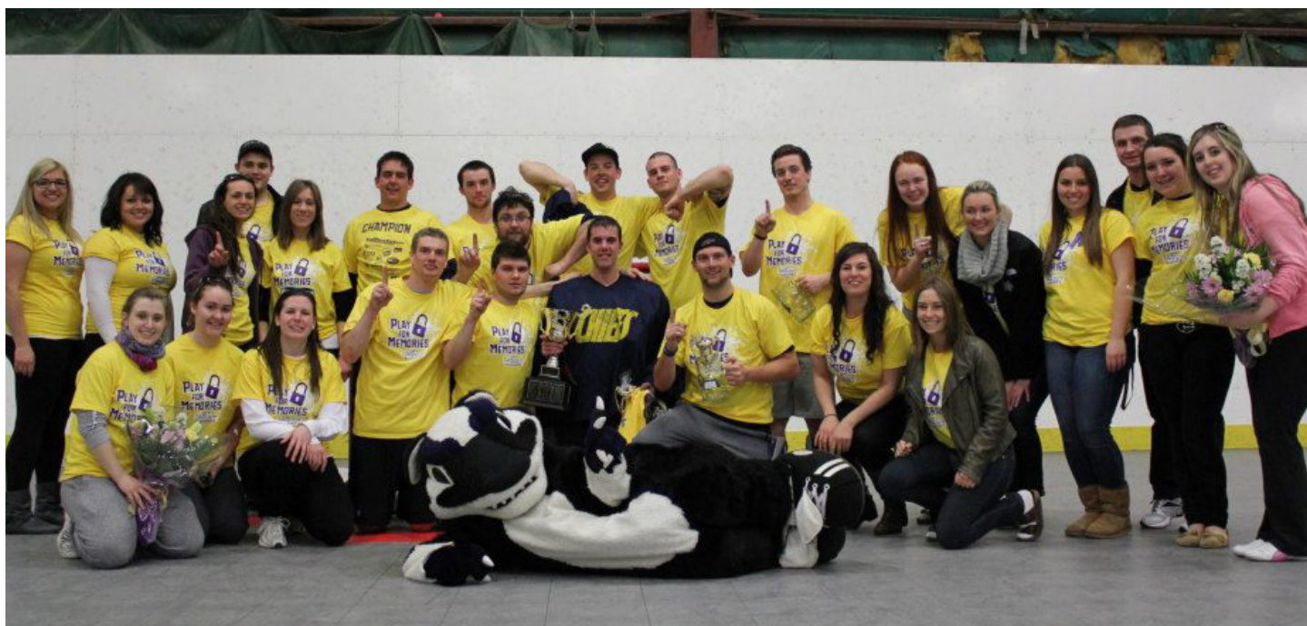
Twenty-four teams participated in the BLCS's Fourth Annual Play for Memories ball hockey tournament