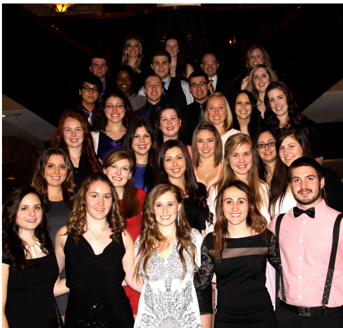
BLCS members celebrating the groups' accomplishments at the Year End Formal