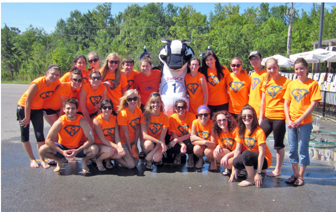
The BLCS at the Shinerama event in September 2011.

It was another successful year for the Brock Leaders Citizenship Society (BLCS), which contributed to numerous organizations and events through fundraising efforts and volunteer work in the 2011-12 school seasons. Our members showed their passion for their communities and leadership capabilities this past year as they actively sought opportunities to get involved, whether through external clubs and associations or our internally organized initiatives. The BLCS is excited to welcome 13 new members to its growing team in the fall. With three incredible years behind us, Year 4 promises to be filled with even more involvement, innovation and inspiration.