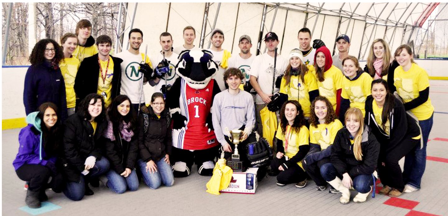
The volunteers and Niagara North Stars celebrating the end of a successful tournament.

This year, the BLCS raised a total of $7,361, over $2,000 more than last year's amount. This makes the running total of donations to the Alzheimer Society more than $15,000. The success of the event would not have been possible without the support of volunteers, participants, and sponsors alike. The BLCS would like to extend their sincere thanks to everyone involved. Your help was unforgettable.