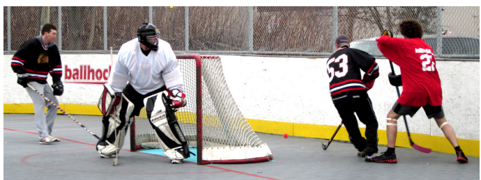
The final game: Blackhawks versus Cougar Hunters 2.

The tournament was a success thanks to numerous sponsors, players, spectators, and volunteers. Together we were able to reach our goal and raise an astounding $5,210!