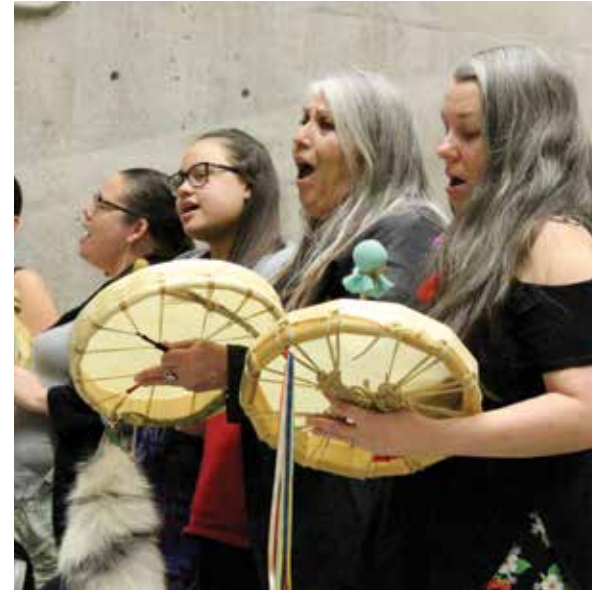
Members of the women's drum group from the Fort Erie Native Friendship Centre accompanied the speakers at the REDress event.

A powerful REDress event on campus focused attention on the crisis of missing and murdered Indigenous women and girls. The gathering was a testament to the strength and resilience of Indigenous women in Canada.