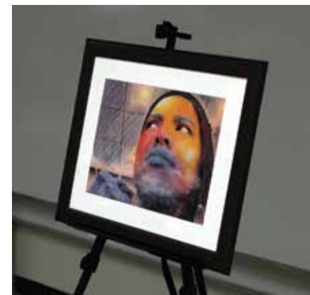
Photos by participants in last year's Body/Land/ Sovereignty project were displayed at this year's REDress Project event.

For over a decade, Brock students and staff have been helping local kids through the Learning Disabilities Association of Niagara Region (LDANR). In April, LDANR presented Brock with the Outstanding Contributor Award to formally recognize the University's role in the organization's success.