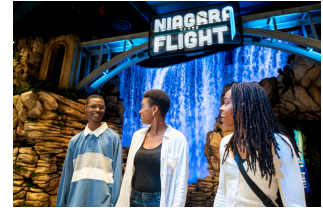
Niagara Takes Flight

You'll soar across 56 kilometers of parkland, from the shores of Lake Ontario to edge of Lake Erie, as breathtaking landscapes unfold beneath you. Gliding over swirling rapids and steep rock faces, past lush forests and through dramatic battles that changed the course of history all before getting closer than ever to the thundering Horseshoe Falls.