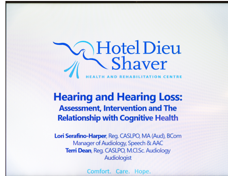
Hotel Dieu Shaver