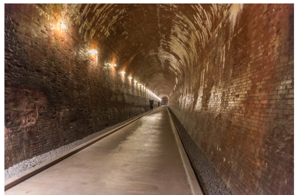
Niagara Power Station Tunnel