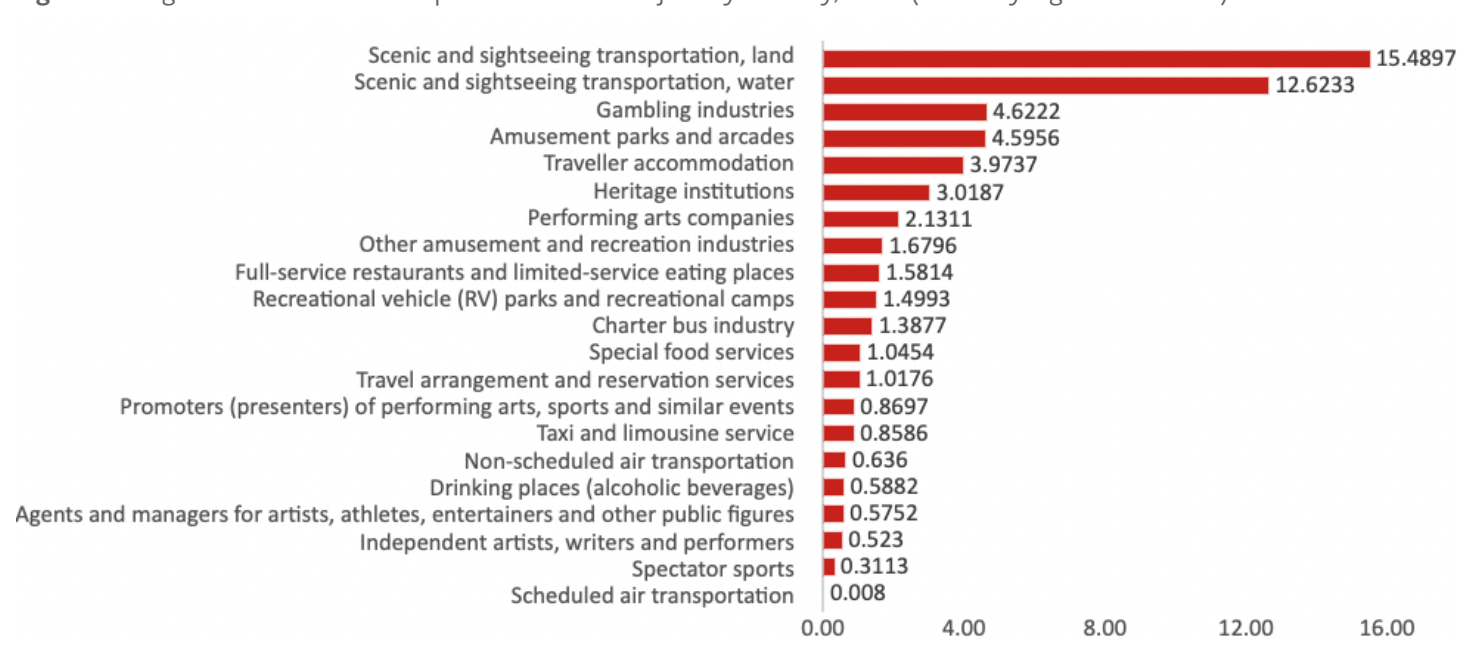
Figure 2: Niagara's national location quotient for tourism jobs by industry, 2022 (sorted by highest to lowest)