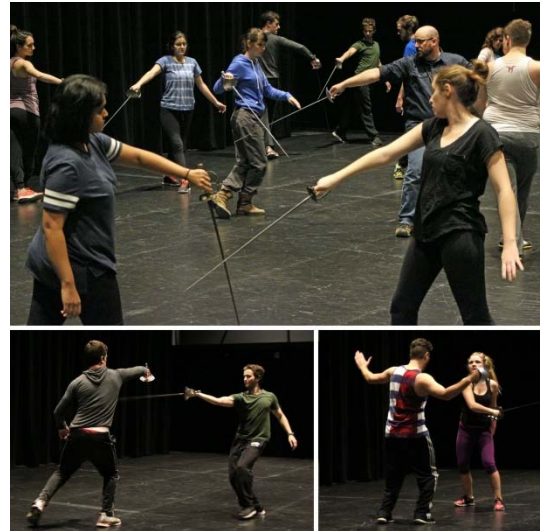
Our students rehearsing stage combat for this production.

This production of Goodnight Desdemona (Good Morning Juliet) is suitable for High School-Age audiences and provides an opportunity to enjoy the accessibility of Shakespeare in this comedic re-imagining of two of his famous tragedies while combining both Shakespeare's language with modern and colloquial language. Curriculum connections include The Arts, Canadian and World Studies, Classical and International Languages, English, English As a Second Language and English Literacy Development, Social Sciences and Humanities. This production provides corresponding study in the following curricular subject areas: Gender studies, Women's studies, Medieval and Renaissance studies, Shakespeare studies and Drama studies.