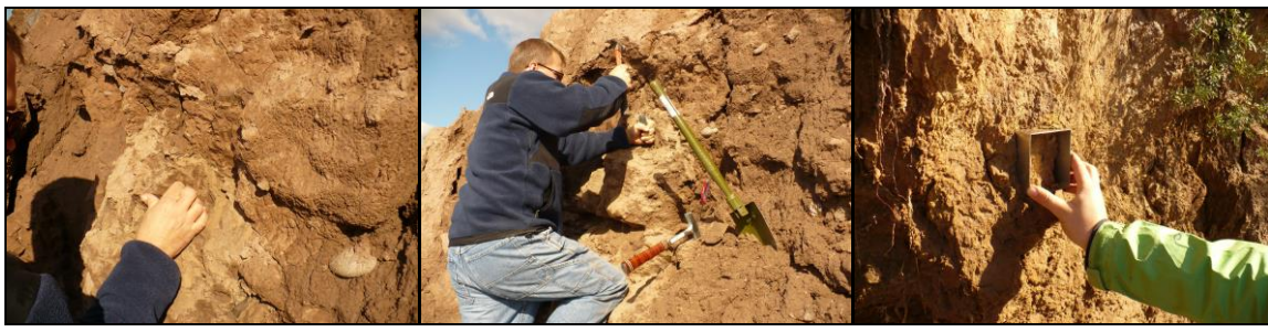
In the field

Our clients can also request for polished thin-sections which are used primarily in the observation of microstructures in reflective light. The polished thin-sections are prepared in routine fashion using an automatic polisher, starting with coarse to intermediate polishing using diamond abrasives and finishing with polishing alumina.