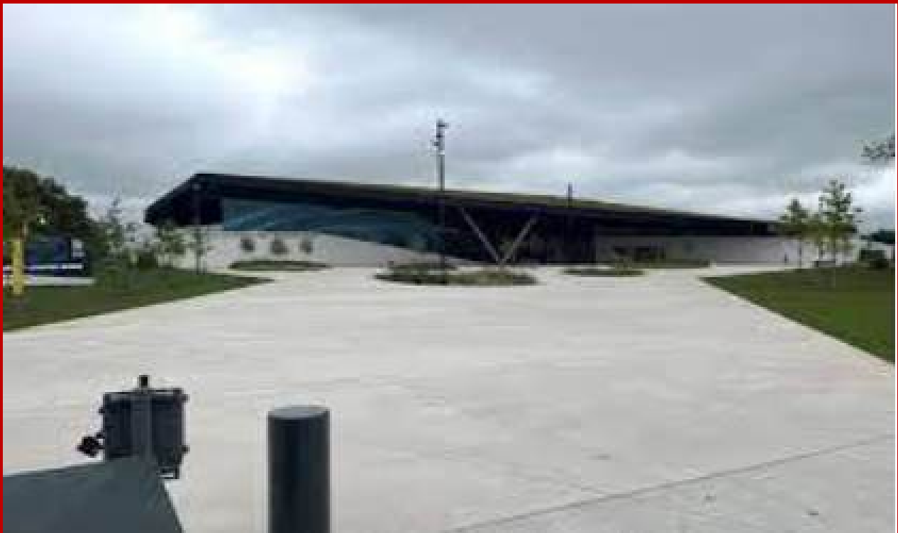
ENTRANCE TO CANADA GAMES PARK

The parking lot for Walker Sports and Abilities Centre is located off Flora Egerter Way in front of the Canada Games building.