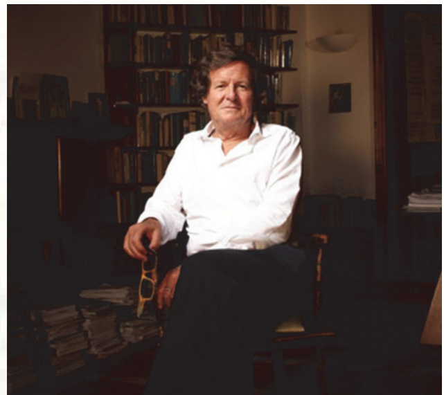
David Hare, 2010. https://www.bafta.org/access-all-areas/screenwriting/profiles/sir-davihare,1426,BA.html

David Hare is an English writer born and bred. He was born on June 5, 1947 in East Essex. He attended Lancing College, then moved to Jesus College, Cambridge where he earned his MA in English. His first playwriting gig was actually an accident, as he was working for Portable Theatre Company, which he co-founded when a playwright dropped out at the last minute and left the company without a script. After that, he was commissioned to write a full length play called Slag which was first produced in 1970.