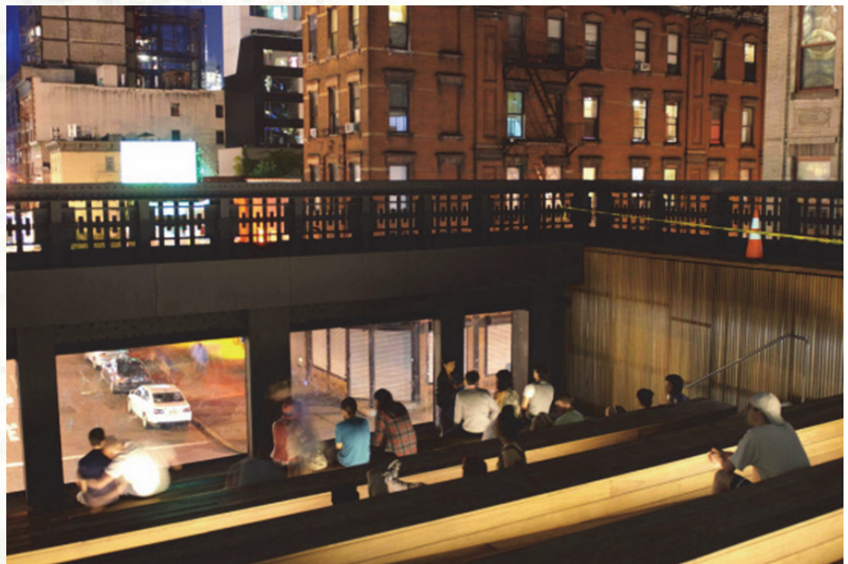
The Highline in New York, view from inside the seating area.

Why? The first question that needed to be answered for this production was why do all of these characters have sex or at least try to have sex? It seemed to us it was about the search for a connection in a world that leaves one feeling alone and sometimes even