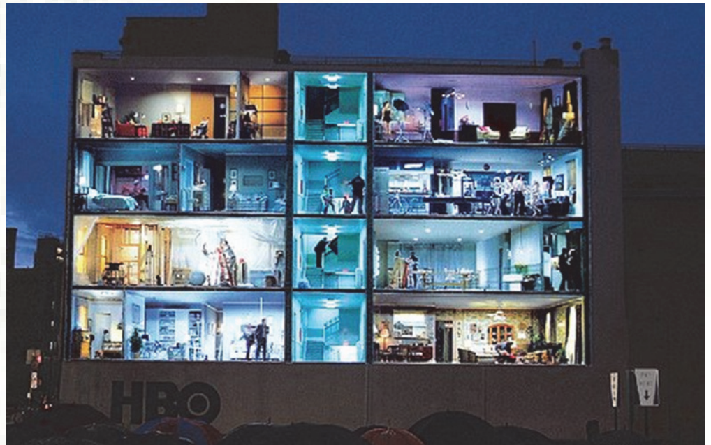
HBO's Voyeur Campaign, New York, 2008. http://indiadrant.blogspot.ca/2008/06/voyeur-bbdo-nys-work-for-hbo.html

and with the rise of the nouveaux riches, there was also a break in traditions or at least loopholes. Affairs were known to occur and continue, as long as they did not interfere too publicly with those involved. Risk maintains a major role in sex today. Even in our daily lives, risk seems to have