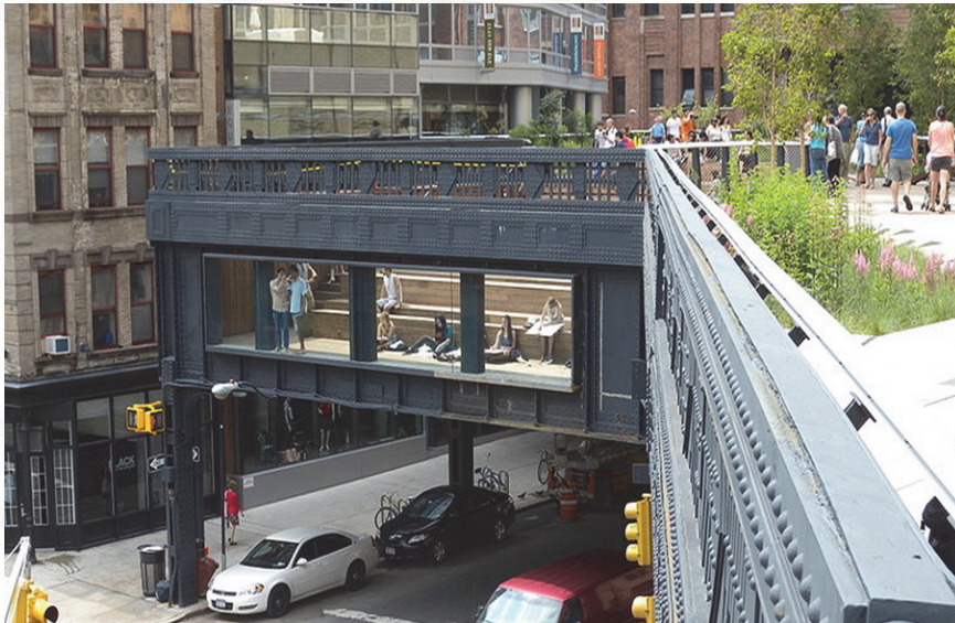
New York The Highline, view from the outside.

used. It was the image of particles moving through space crashing into one another, bouncing off, only to be thrown in another direction, just as these characters crash into one another. These were the starting places for the development of this production and eventually the creation of a new character Azzurra. The Ophüls film offered a precedent for a framing character, in his case a ringmaster to keep the story moving. Our Azzurra had a lot to do with where these 10 scenes were going to be situated. In the original version by David Hare, all 10 characters were played by 2 actors and the entire play was set in a non-descript room that was able to be transformed by the actors. In this production, all 10 characters were played by individual actors. A place where all these encounters could take place was necessary. It became very evident that a major theme of the production was watching or being watched during these scenes, as voyeurism, almost a Big Brother or reality show type setting. A place that was controlled by someone, a person that watched all these relationships unfold and organize a suitable place for the next encounter to unravel. Game shows, reality TV and voyeurism were all explored in an attempt to understand why the audience is able to see these scenes.