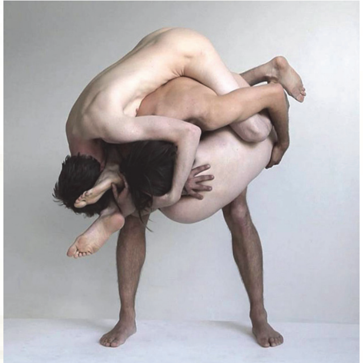
By: Artistic unit JocJonJosch, "Existere" Project, 2011. http://now-here-this.timeout.com/2011/06/06/naked-participants-needed-for-jocjonjoschs-existere-project/

SEC's mission is to foster "a sex-positive attitude in the greater U of T area, by offering information, programming, safer-sex supplies, and peer counseling in a welcoming environment"(same). This is just one example of how sex is becoming more openly acceptable - without taboo. Even if only limited to a club or darkened corner, the fact is that sex is now at least a more openly discussed part of our culture. The Blue Room illustrates the sometimes overlooked reality of relationships; the power of the mind in many states, and analyzes the harshness and complexity of human interaction both before and after sex; from the risks these characters will take in pursuit of excitement, fantasies or thrills, only to discover afterwards that perhaps the risk was far too great or perhaps not satisfying enough.