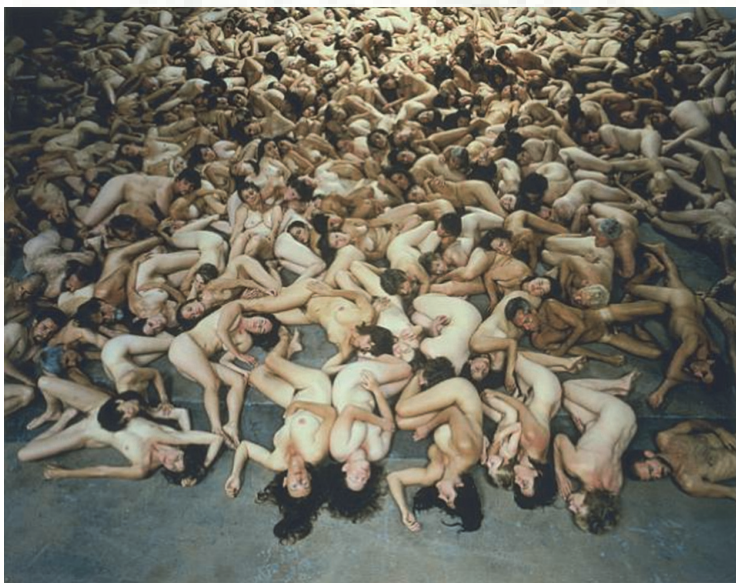
Spencer Tunick, Entanglement. http://spencertunick.com/