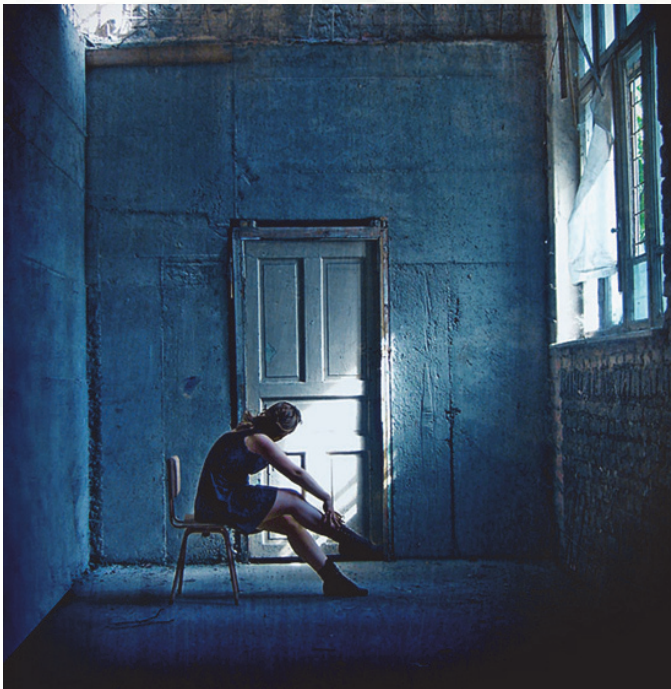
Blue Room.