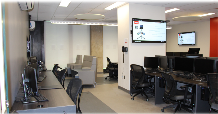
Photo: The CDH's Collaborative Production Lab for students (TH269H).

Other facilities and technologies are maintained by Brock University or the DDH's partners. They are available for shared use by IASC students as outlined below.