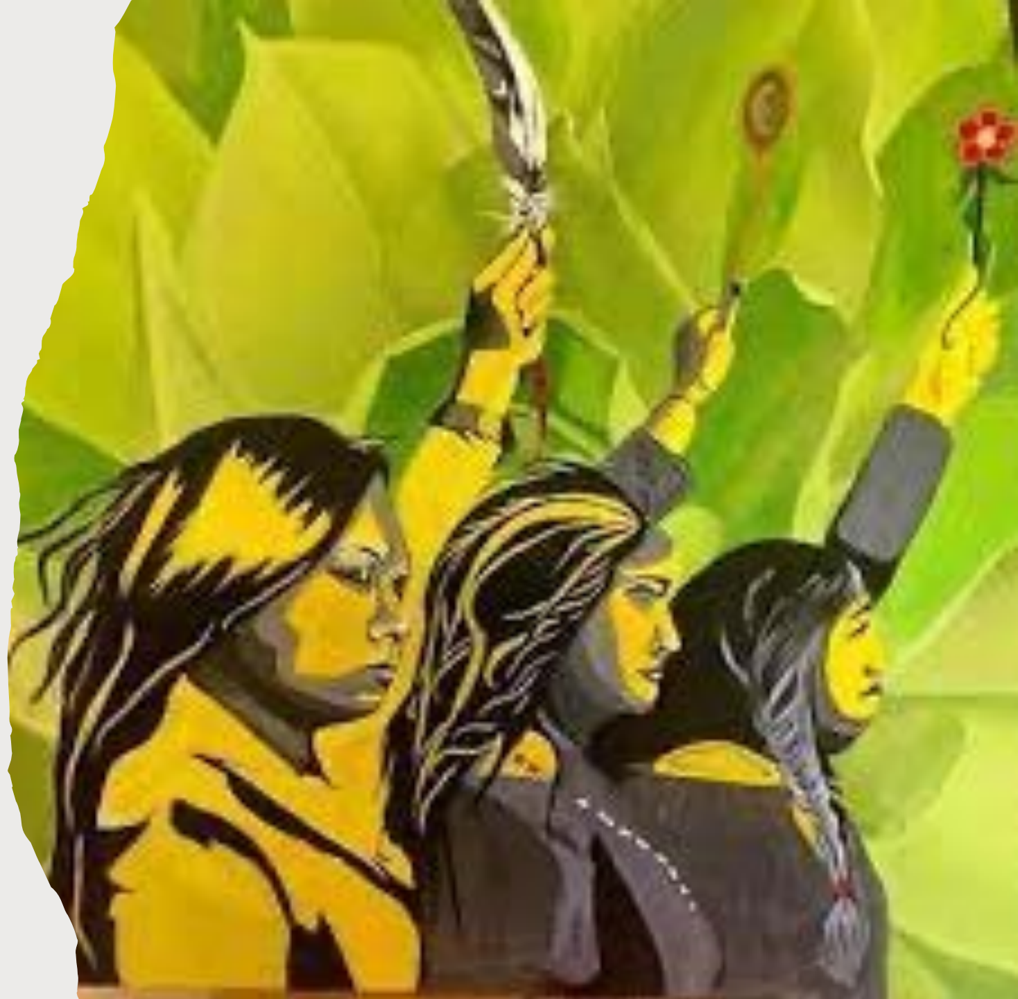
Image credit: Angela Sterritt – “Honour the Dead, Fight for the Living. Honour the Living, Fight for the Dead”