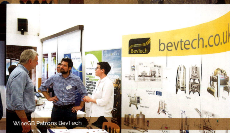
WineGB Patrons BevTech