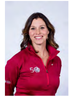
Catriona Le May Doan