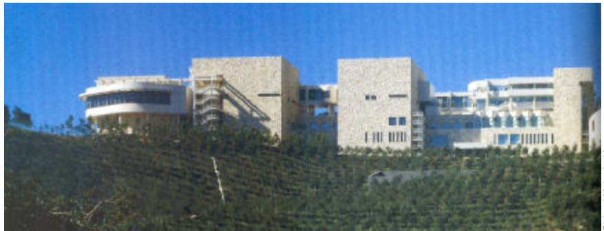
Richard Meier Architects