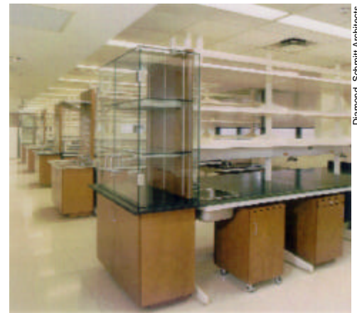
Diamond, Schmitt Architects