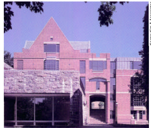
Koeter Kim & Associates