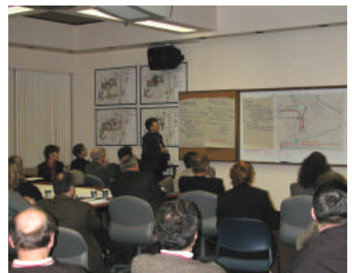
An open dialogue will continue to inform the campus planning and design process.