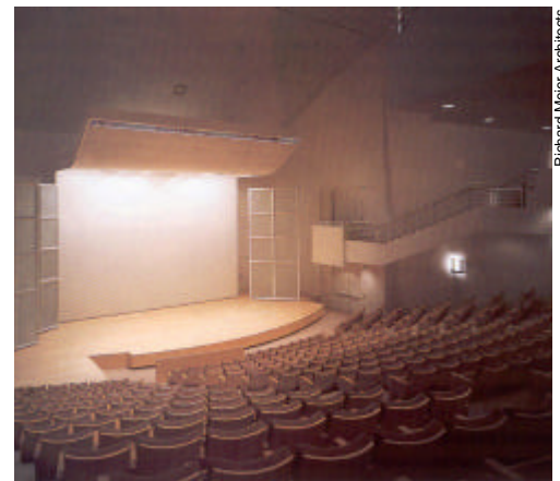
Richard Meier Architects

The Campus Plan must accommodate the growth of all the University's programmatic needs.