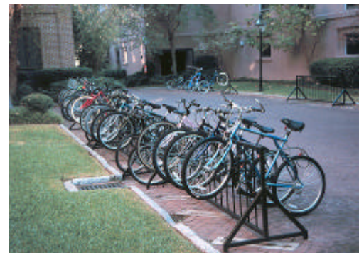
The campus will accommodate and balance all types of movement.