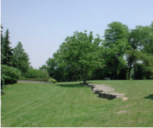
Stewardship of the Niagara Escarpment and other natural areas on the campus is a key aspect of the Campus Plan.